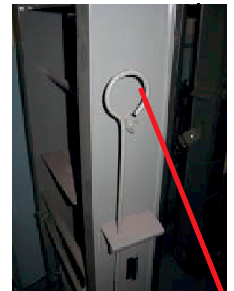
Caster Carriage Release