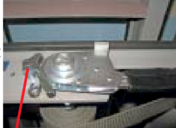
Pawl in unlocked position